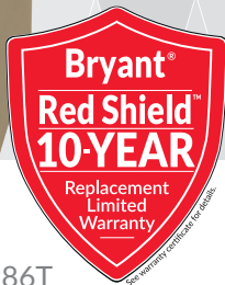
Model 987M and 986T